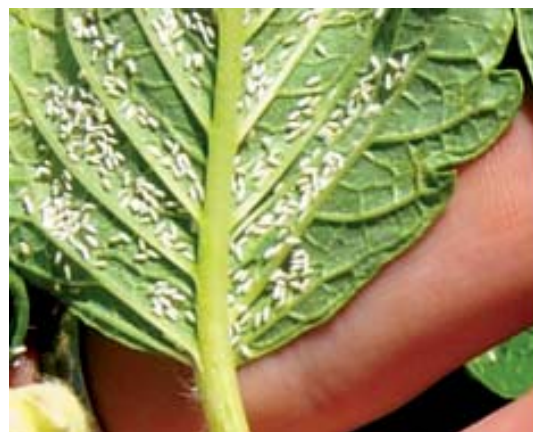
SLW infesting sesame