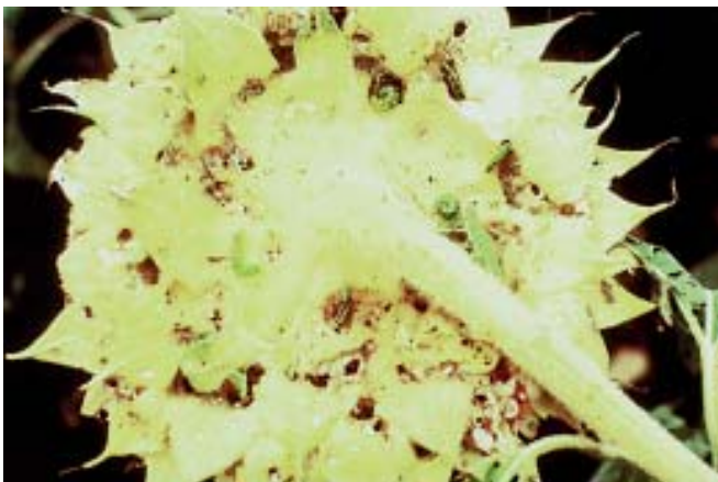
Heliothis or Budworm ( Heliothis spp. )

Head ( flowering-grain fill ): At this stage the plant is able to tolerate large populations. Damage to the back of the head may predispose the head to rots,