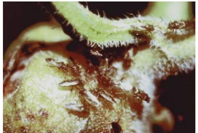
Rutherglen bug ( Nysius spp. )

The most likely and most damaging insect pest.