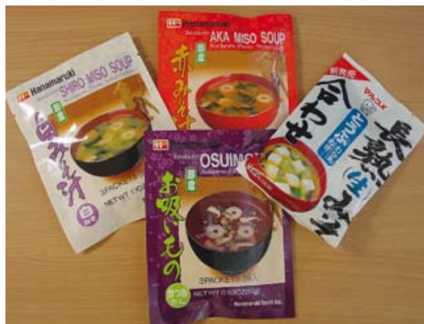
Miso and natto are both fermented soybean products used in traditional Japanese cooking.

Demand has increased with the opening of National Food's soymilk plant and the general increase in the popularity of organic soy products. This demand may continue to grow.