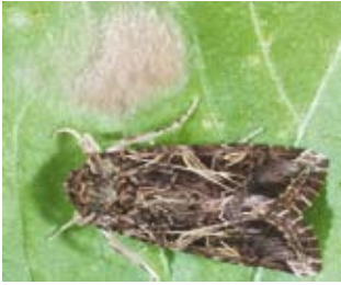
Cluster caterpillar moth and egg pouch.

larvae. In pre-flowering crops, control is warranted if defoliation exceeds (or likely to) 33% (refer to section on helioverpa). Tolerable defoliation drops to 15-20% once flowering and podding commences. NPV does not control cluster caterpillars and they are difficult to control with Bt unless they are very small.