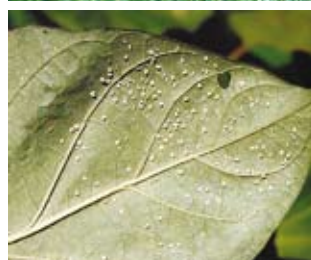
Silverleaf white fly nymph (top, left), adult (top, right) and leaf damage (left).