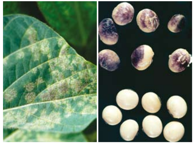
Downy mildew (left) and purple seed stain (right).

Plants infested with sclerotinia develop a white, cottony growth on stems followed by the formation of large, black sclerotia (resting bodies of the