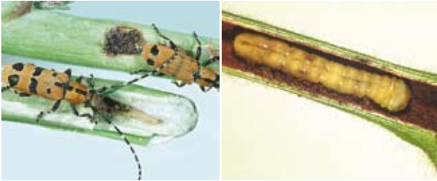
Lucerne crown borer ( Zygrita diva ) (left) and a larvae feeding inside a sybean stem (right).

symptom of damage is the webbing and folding together of leaves. The larvae normally only cause cosmetic damage.