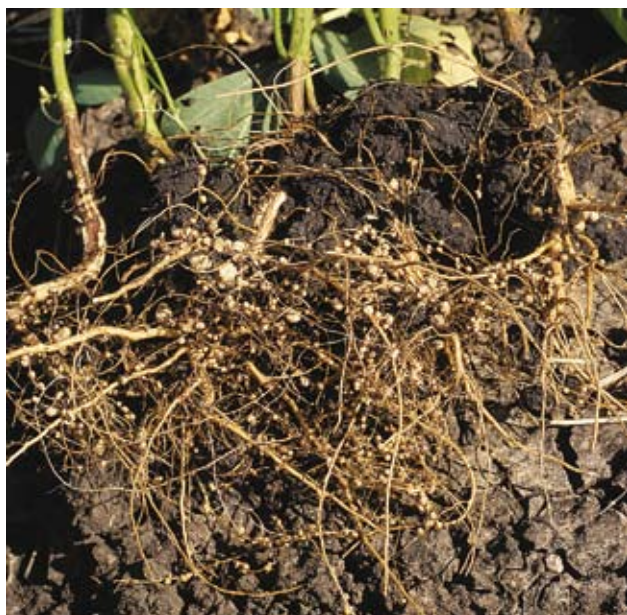
Effective inoculation is essential for good nodulation.

Rhizobia are living organisms and very sensitive to hot, dry conditions. Store in a cool place, preferably the refrigerator (but not the freezer). Likewise, inoculated seed should be kept in a cool shady place out of direct sunlight. Only treat enough