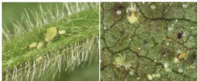
Soybean aphids (left) and two-spotted mites (right).

Damage: Mites can cause severe damage, particularly during hot, dry weather. Outbreaks are often the result of using 'hard' pesticides to treat other pests, where the killing of their natural enemies flares mite numbers. Heavy infestations at pod-fill lead to leaf drop and early senescence.