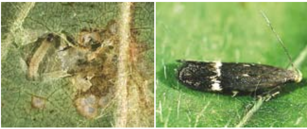
Soybean moth caterpillar and adult.