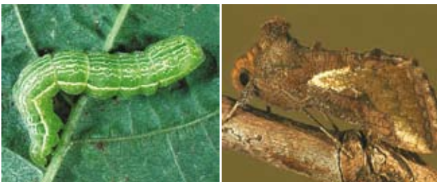
Green looper caterpillar and adult.

Risk period and damage: Etiella is a spasmodic but important pest of specialist soybeans in drier regions (e.g. natto soybeans on the Darling Downs) due to near zero damage tolerance. Crops may be infested from flowering onwards, but are at greatest risk during late podding. Etiella larvae consume far less than larger caterpillar species such as helioverpa, so seeds are usually only partially eaten out, often