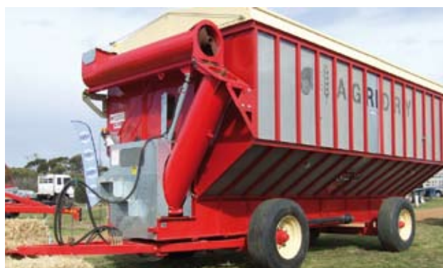
Top: Loading with a belt auger.