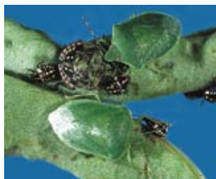
Green vegetable bug adults and nymphs.

Damage: Pods most at risk are those containing well-developed seeds. While GVB also damages buds and flowers, soybeans can compensate for this early