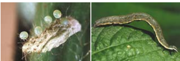
Mocis (brown looper) eggs and caterpillar.

with characteristic pin-hole damage. This damage is difficult to grade out and its unattractive appearance reduces seed quality.