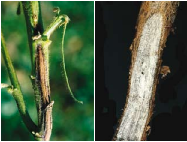
Phytophthora (left) and charcoal stem rot (right).

Phytophthora root rot is found throughout all growing regions, and is most severe on heavy, poorly drained soils where soybeans have been grown continuously for several years. Avoid planting susceptible varieties where there is a history of the disease in the paddock. The disease is specific to soybeans and does not occur in other crops or weeds.