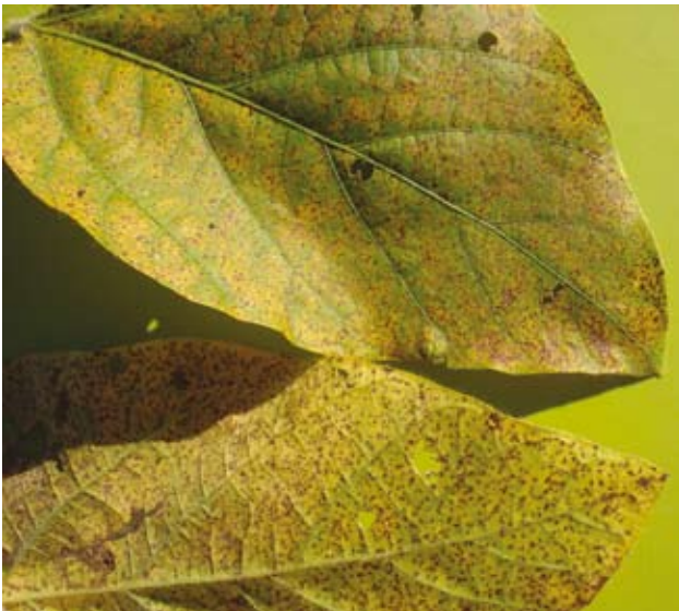
Leaf rust.