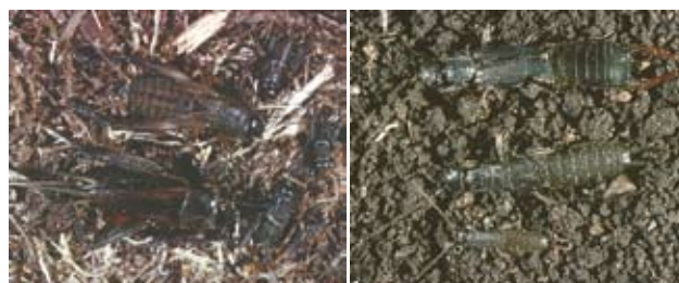
Black field cricket adults and nymphs (left) and black field earwigs (right).

Trials have shown that the addition of salt (0.5% NaCl) as an adjuvant can improve chemical control