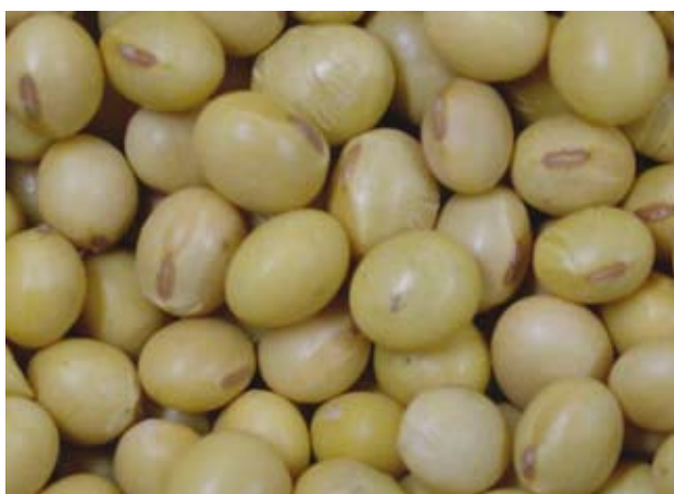
Varieties with light coloured hila are acceptable for the culinary trade.

Growers considering organic soybean production should discuss the industry's requirements with local traders and processors. Please refer to the AOF marketing guide.