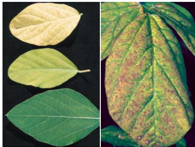
Nitrogen deficiency (left) is usually due to poor nodulation. Zinc deficiency (right) is treated with a foliar application of zinc sulphate.

Low rates of sulfate of ammonia can also be used to correct a sulfur deficiency in situations where soil P levels are already considered adequate.