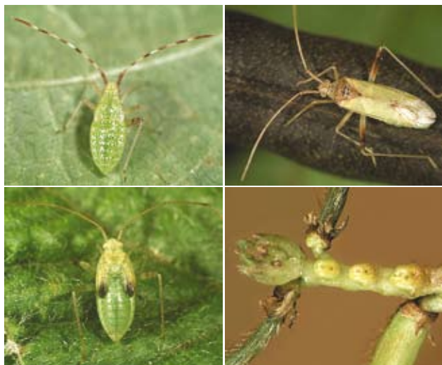
Top: Brown mirid nymph (left) and adult (right). Bottom: Green mirid (left) and plant damage (right).

Seed size and yield may be reduced by as much as 30% in severe cases. Mites first occur on the lower leaves and gradually move to the top of the plant as the population builds up. They make fine webbing on the underside of the leaves, and feed by a rasping and sucking action. Infested leaves take on a speckled appearance and, in severe cases, the leaves turn a yellow-brown before they wither and drop from the plant.