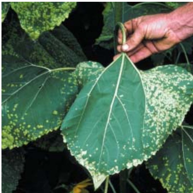
White Blister ( Albugo trogopogonis )