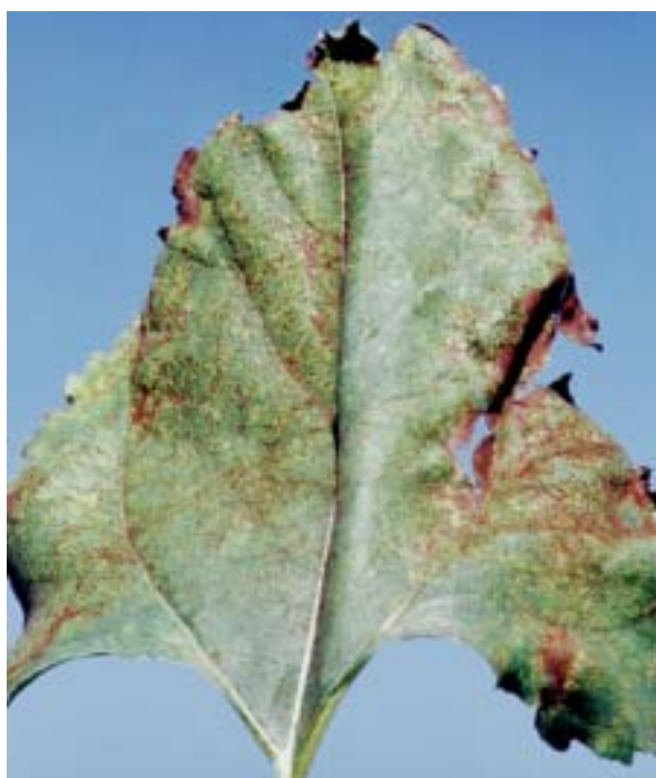
Red Rust ( Puccinia helianthi )

Development of the disease is favoured by warm (26-30°C) wet weather. Infection is highly dependent on long periods of leaf wetness. Rain periods lasting for several days cause the disease to develop rapidly. Airborne spores produced on necrotic (dead) tissue initiate new infections. Seedling and flowering plants are highly susceptible. Older (lower) leaves are more susceptible.