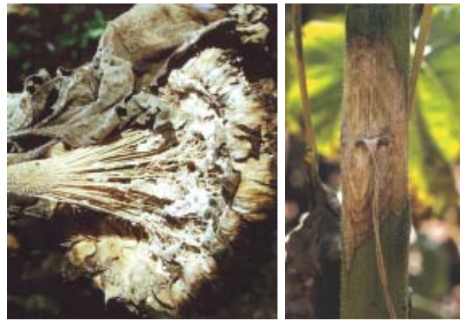
Sclerotinia Head & Stem Rot ( Sclerotinia sclerotiorum )

Flower heads that are infected show a light brown rot on the back of the head, which may extend down the stalk. Rotted heads eventually fall apart, leaving only the fibrous strands of the stalk. Sclerotes form in the rotted tissue.